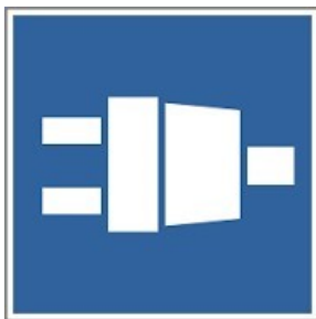
Figure 3: Proposed pictogram.

The proposed pictogram (size 300 x 300 mm) for use on the shore power unit is as follows: